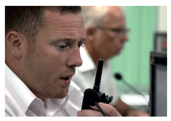
Effective communication becomes more difficult under pressure and it is important that this skill is regularly practiced following training.

CPNI's research has highlighted that security personnel seldom practice radio communications in the context of an emergency; personnel talk over one another, broadcast unnecessarily long, rambling messages blocking others on the channel and ask for updates rather than trusting that updates will be provided when available. It is crucial that personnel are concise when conveying information and are fluent in your organisation's radio protocol (such as saying 'over' when ending a transmission that expects a reply and 'out' when ending an exchange).