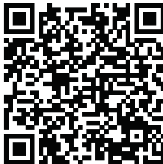
Android Play Store QR Code

If your organisation has managed devices (i.e. company issued mobiles or tablets) – consider an automatic rollout solution. You can find further details by contacting CT@HighfieldELearning.com requesting 'Enterprise' options.